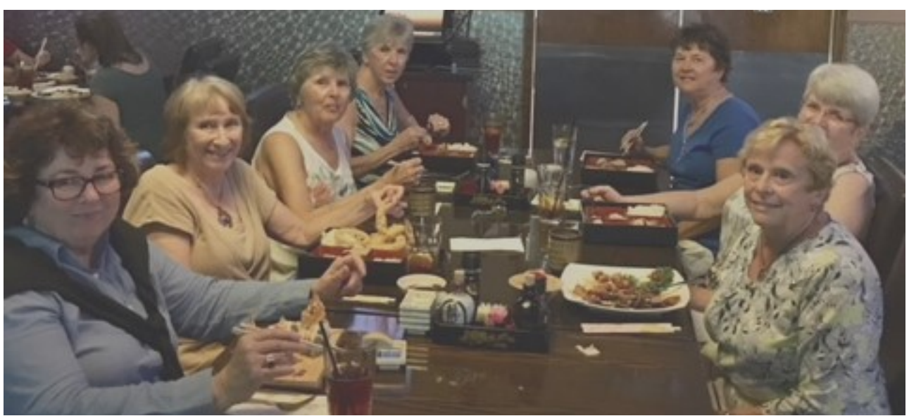
September Women's Club lunch @ Fujiyama