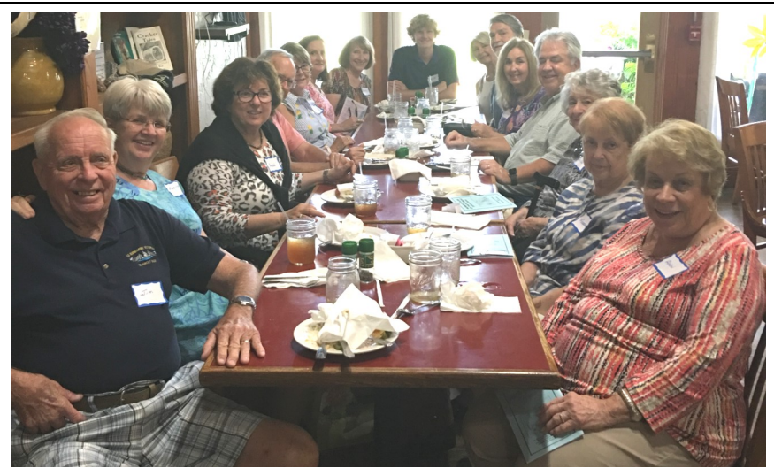
Seminole Inn Women's Club Brunch

Sunday, September 9th - 15 in attendance included tour of historic inn built in 1926