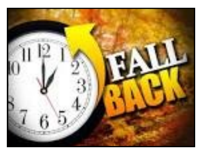
Don't forget to FALL BACK on Sunday, November 4—2AM