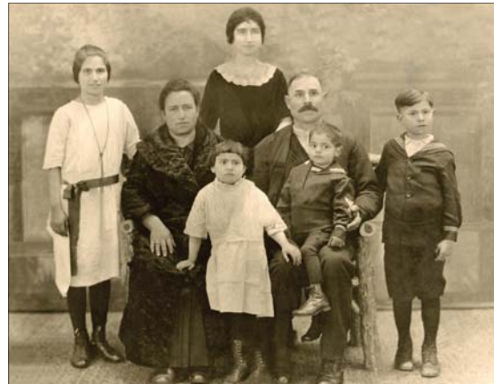
A friend's old family portrait - after