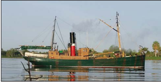
The steam drifter herring boat Emily K under way on Tradition Lake