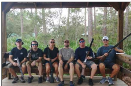
The family that shoots together...