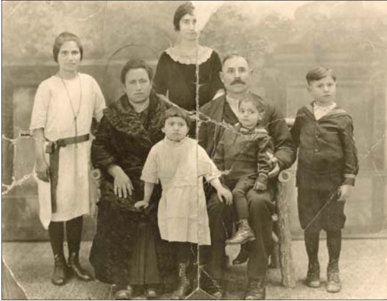
A friend's old family portrait - before

I also enjoy repairing and restoring old photographs. Below are some of my favorite completed projects. The repair of each image takes many hours of focus, concentration and imagination using a high-quality scanner and Photoshop. The time that I work on these images becomes a meditation, and the final result can be magical! —Jack Spyker-Oles