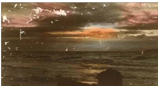
A badly damaged old postcard - before

Each image has its own history and back story, and that becomes part of the fun of bringing the image back to life. In case you're wondering, I don't do this for hire; it's strictly a hobby.