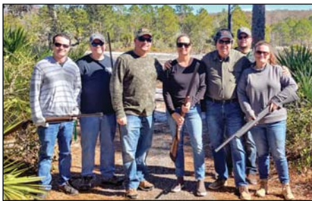
It's a family affair