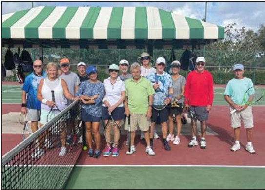
Photo taken on the courts October 12, 2022

Last April, members of the Retreat Tennis Club took off their sneakers and T-shirts, left their racquets at home and partied at the clubhouse. It was the annual celebration to mark the unofficial end-of-season and affords an opportunity to wish our 'snowbird' friends and neighbors a fond Farewell .