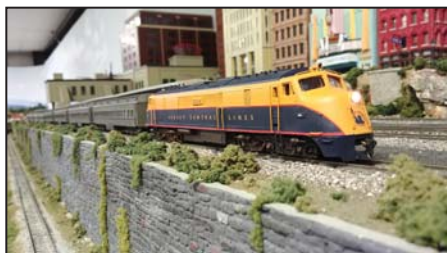
Jersey Central Railroad Baldwin DRX-6-4-2000 diesel locomotive

The train photo shows my built up HO scale model of a Jersey Central Railroad Baldwin DRX-6-4-2000 diesel locomotive #2004 sporting the tangerine and blue livery on the point of an eight car passenger train at the St. Lucie station on the Treasure Coast Model Railroad Club, Port St. Lucie, Florida. See www.TCMRR.org . for more information.