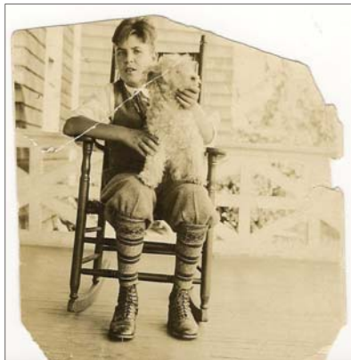
A friend's father as a boy - before