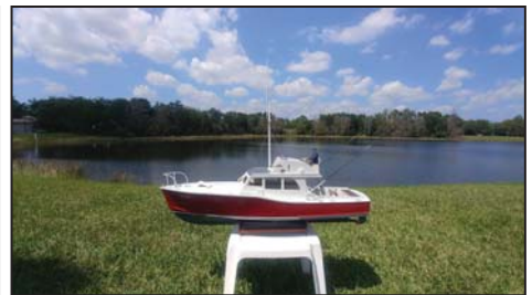
Two photos of the red-hulled sport fisher Hobo