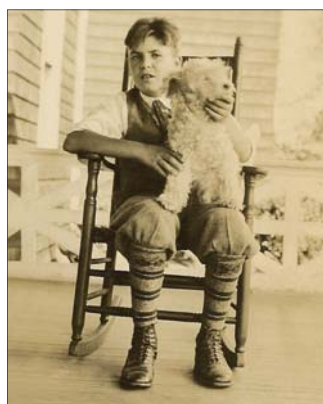
A friend's father as a boy - after

Each image has its own history and back story, and that becomes part of the fun of bringing the image back to life. In case you're wondering, I don't do this for hire; it's strictly a hobby.