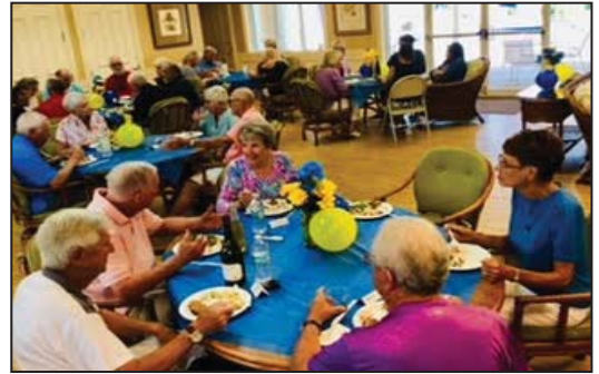
Photo taken at the clubhouse April 23, 2022

With our hot, humid summer (almost) past, those (relatively few) who play here year-round were at the courts this week and happily welcomed back several who have already returned and resumed playing.