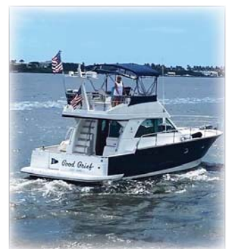
The Good Grief