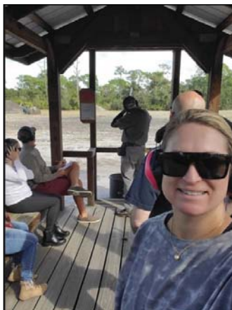
A day at the Ranch