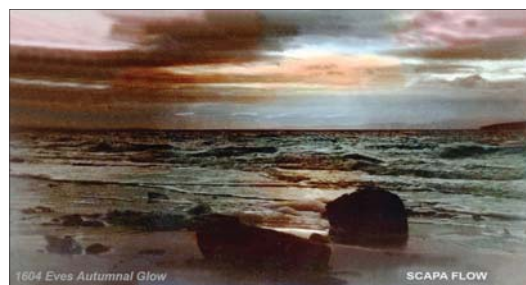
A badly damaged old postcard - after