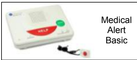
Medical Alert Basic

*Fall detection requires additional fee. Fall detection pendant may not detect 100% of falls. If able, user should always push their help button when they need assistance.