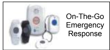
On-The-Go Emergency Response