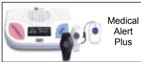
Medical Alert Plus