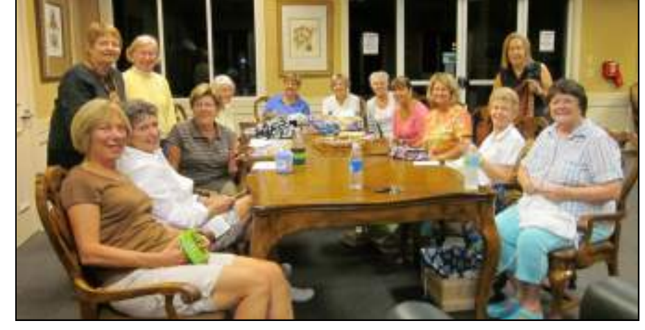
KNOT JUST KNITTING LADIES