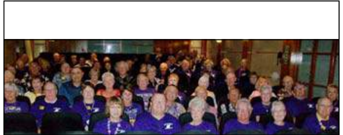
RELAY FOR LIFE FUNDRAISER - 78 Retreat residents and a few of their friends go cruising to raise money for the fight against cancer.