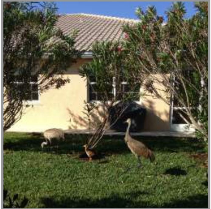
SAND HILL CRANE FAMILY