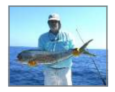
MY FIRST DOLPHIN IN MY NEW BOAT; KEEPER SNOOK AND FLOUNDER