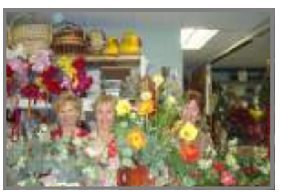
Silk flower arrangement class at Country Club Florist