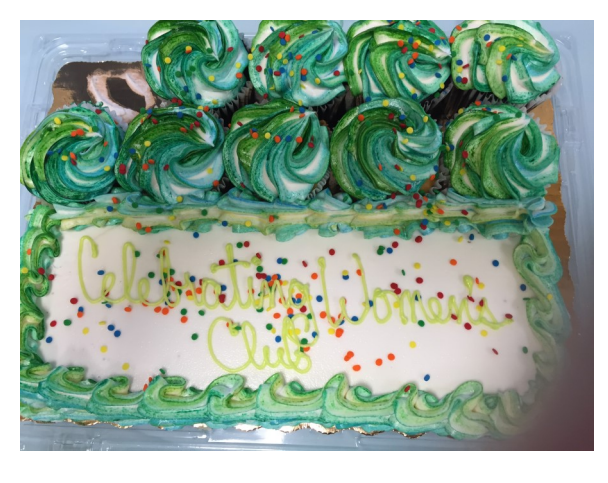
Celebrating Women's Club