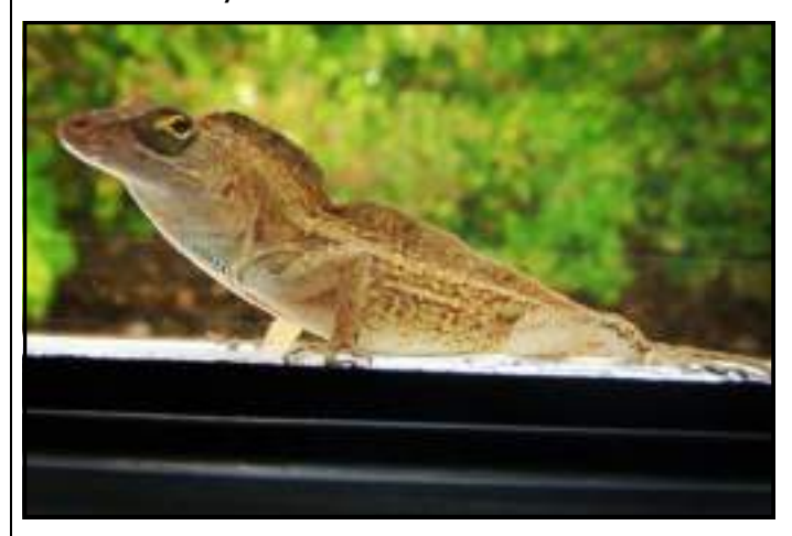
Top picture—This fellow likes to perch on the sill of the window in our front door. He's not shy about looking right in at us.