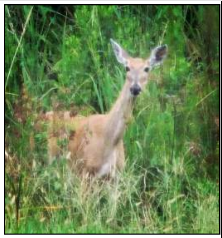
Top picture—This beautiful doe emerged from the preserve behind our house while we were having dinner in the lanai. She stared at us for some time, then darted away. I think she may be a friend of the raccoon. (The picture of the raccoon was in the last Retreat Newsletter.)