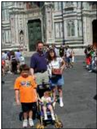
The Duomo in Florence

was spent in a villa called San Benedetto located in the Tuscan outskirts of Florence in a small town called Montaione. We enjoyed our stay in the villa. We went swimming everyday at the pool, enjoyed al fresco dining every night, enjoyed the beautiful scenery of the Tuscan landscape, and relaxed and caught up with Trent's family. We took many day trips in the surrounding towns