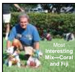
Most Interesting Mix—Coral and Fiji