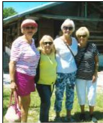
Women's Club outing to Jonathon Dickson State Park May 1st