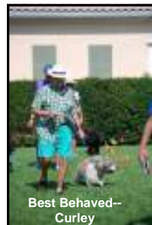
Best Behaved-- Curley