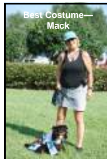
Best Costume— Mack